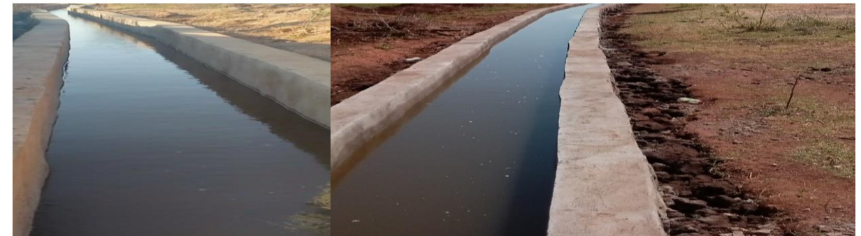
Small Scale Irrigation, Bale, D/Mana & Madawalabu